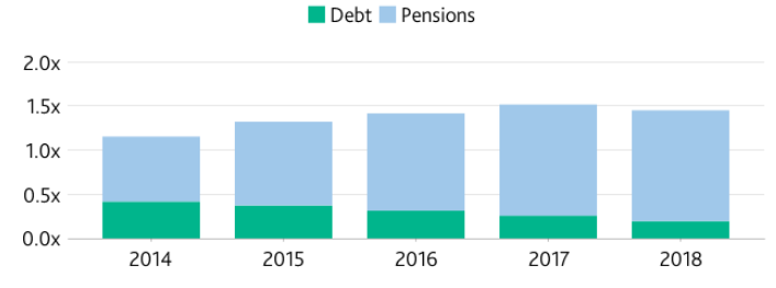
EXHIBIT 4 Moody's-adjusted net pension liability to operating revenues increased from 2014 to 2018