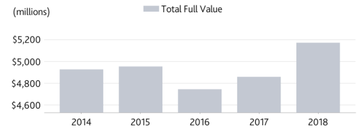
EXHIBIT 3 Full value of the property tax base increased from 2014 to 2018